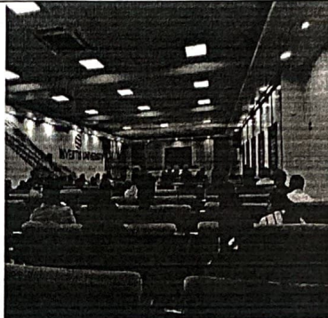
Lecture by VC