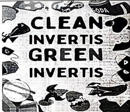
Clean Invertis Green Invertis