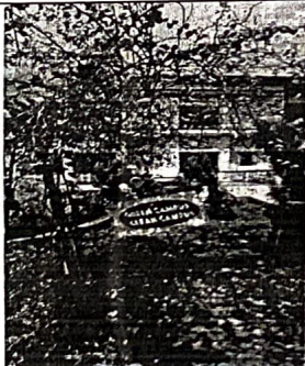
Putting the right foot forward