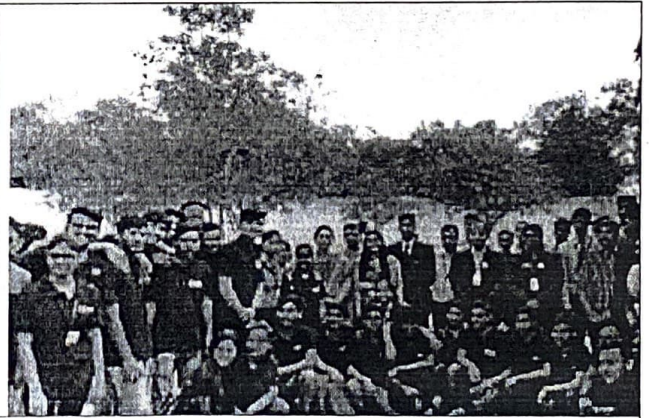
Stop the Drop Campaign