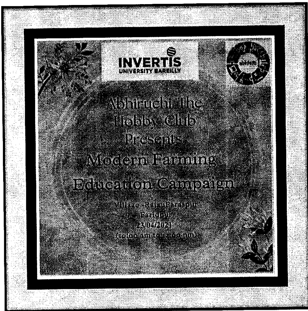
(Sample creative shared on social media 23/04/2021)